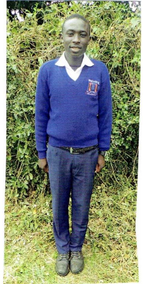
The Board of Deacons